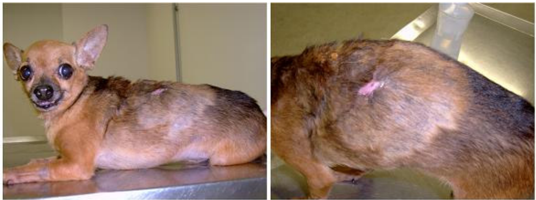
Figures 2: Canine transmissible veneral tumor. The views illustrate the patient one week after the second chemotherapeutic. A 50% reduction of the tumour was observed after the first session and two additional sessions at weekly intervals led to total remission, a result in agreement with the expected and well known effect of VS on TVTc.