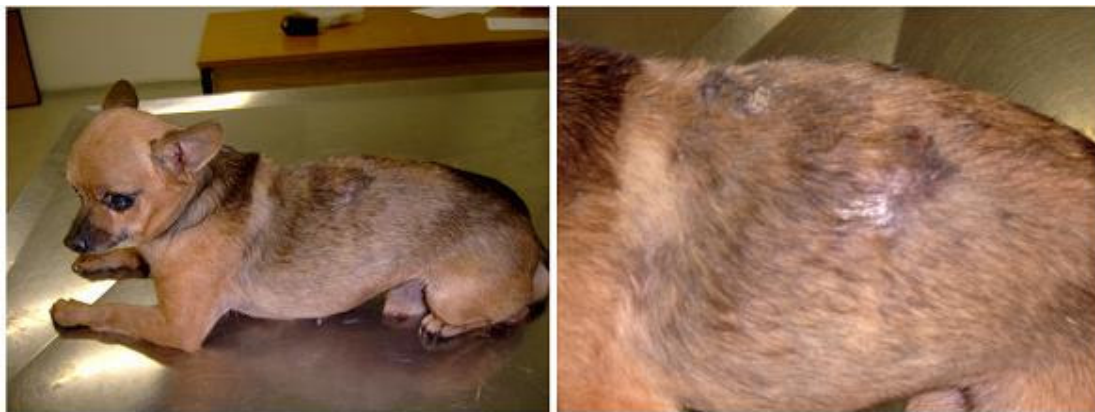
Figures 3: A fifth and final administration of VS was practiced as a preventative measure.

The result strongly suggests that the parenteral supplementary nutrition included on the first five treatment sessions promoted the tumoral development thus interfering with the effect of VS. Also, the rapid irrigation increase of the ulcerated region observed after the single VS and Bionew® administration at the Veterinary Hospital (sixth session) is compatible with a vasodilating effect that could be explained by the synthesis of nitric oxide (NO) 10,11 carried out by tumoral cells from the precursor arginine 11,12 , one of the aminoacids present in the nutritional supplement. In the present case, 40 mg of L-arginine chloride diluted in 2 ml were administered to the patient during the first five sessions of chemotherapy. Delayed and long-